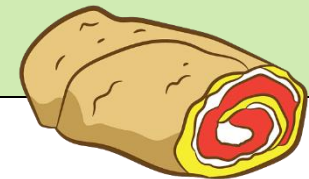
Cheese & Crackers